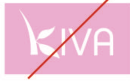
Not enough contrast