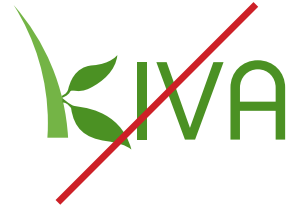
Don't swap Kiva greens