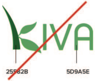
Outdated color guideline